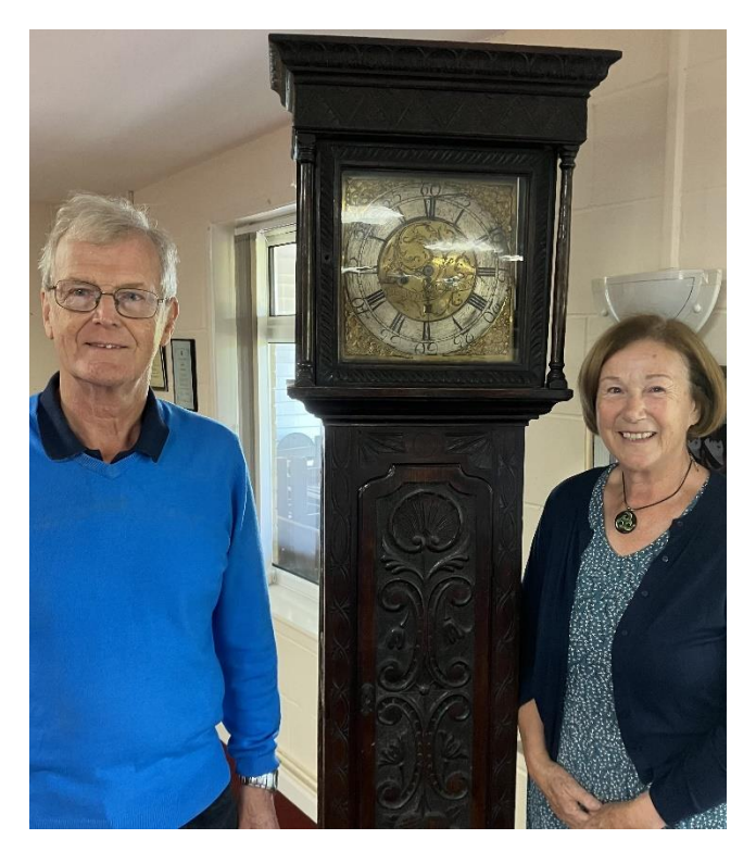
Large item for valuation