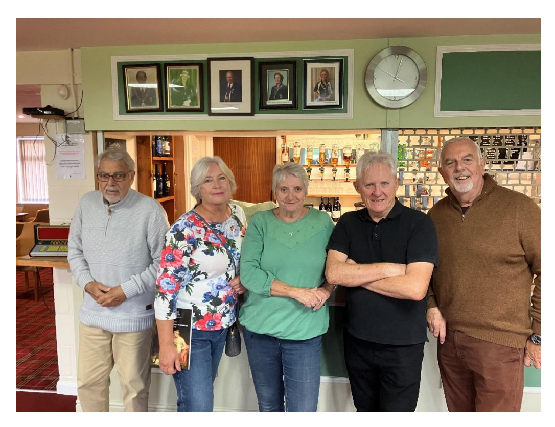
The new Social Committee overseeing the event